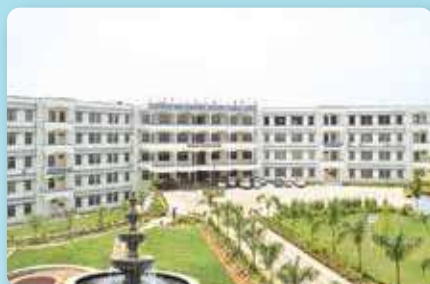
Guru Gobind Singh Educational Society's Technical Campus, Kandra (Chas)