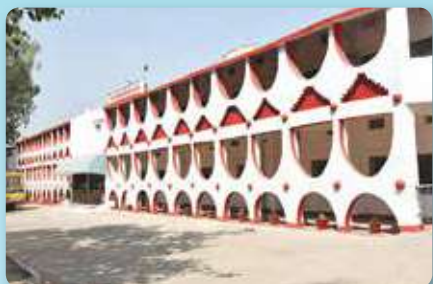
MDN Guru Gobind Singh Public School Daltonganj