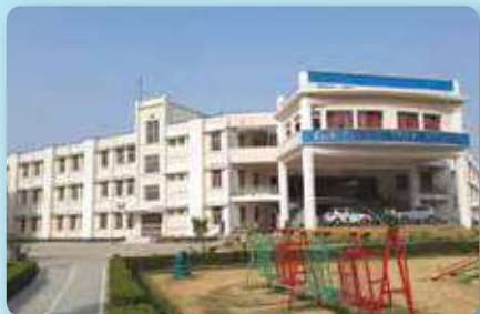
Guru Gobind Singh Public School Phase-IX, Sector-63, Mohali