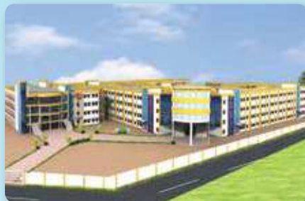
Guru Gobind Singh Public School Hoshiarpur