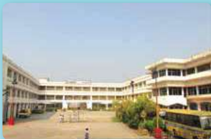
Guru Gobind Singh Public School Dhanbad