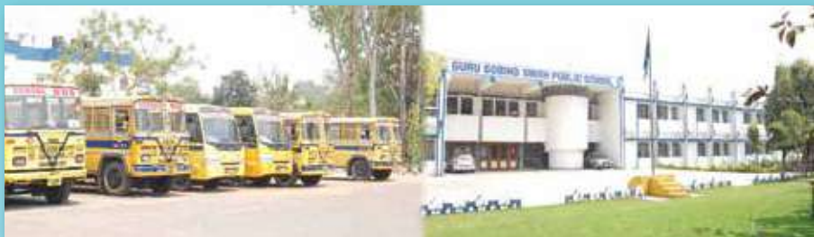
Main Branch GGPS, Sector-V, Bokaro