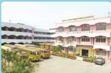
Guru Gobind Singh Public School Chas